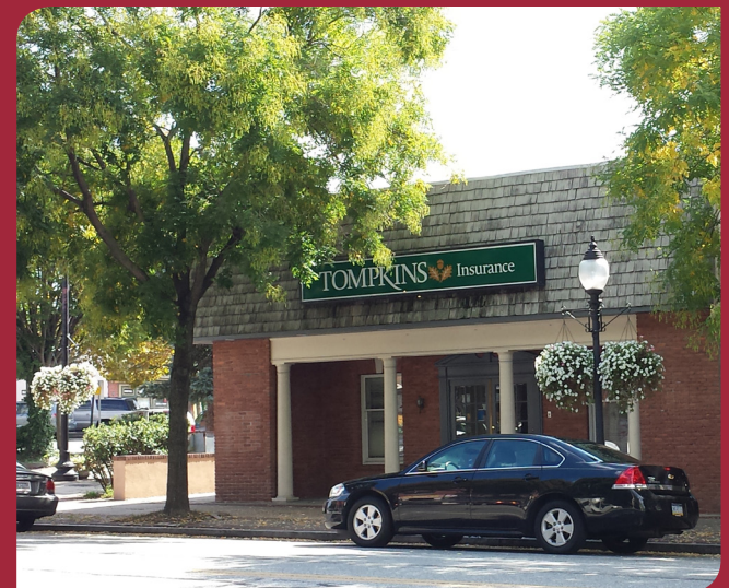
Public parking is available next door to Tompkins Insurance.

For more information, visit https://www.tompkinsins.com .