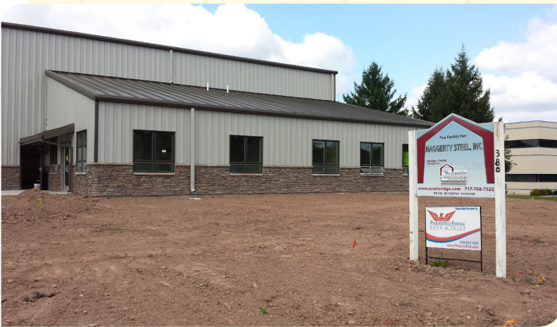
Haggerty Steel recently completed construction of its new facility.