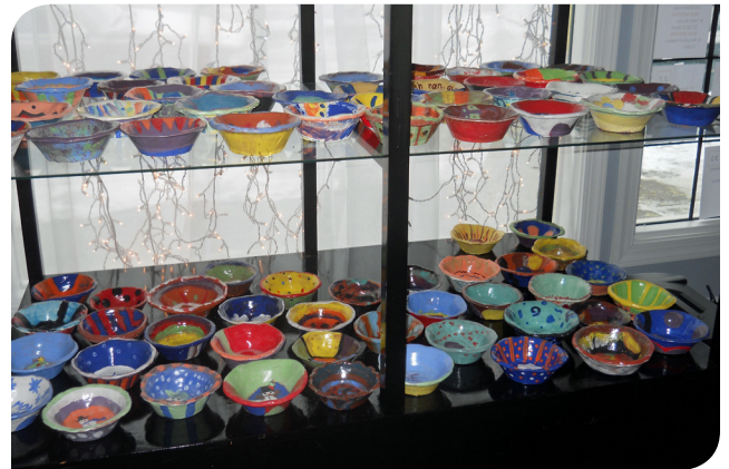
Here is a look at the bowls created for last year's Soup Bowl Fundraiser.