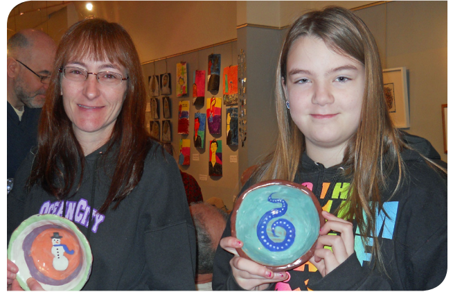
Guests from last year's Soup Bowl Fundraiser at ArtFusion 19464 show off some hand-crafted bowls.

For more information, visit www.artfusion19464.org .