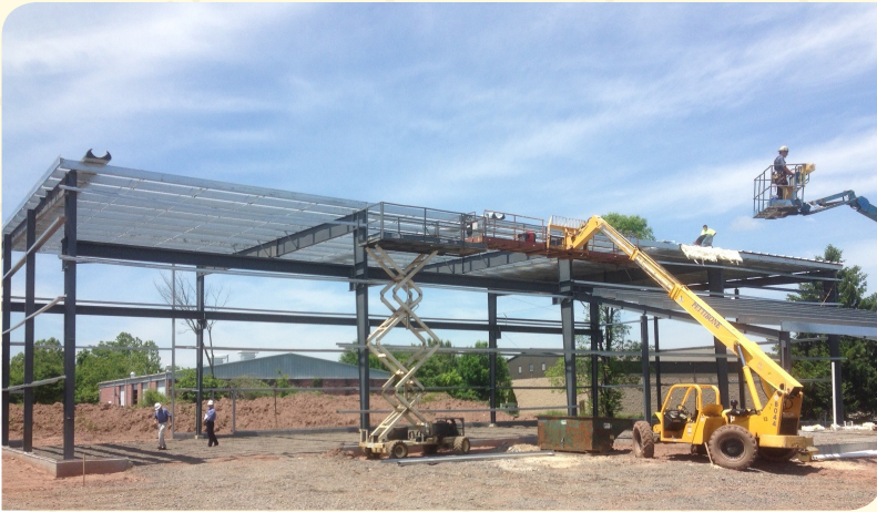
A look at the Haggerty Steel building in the early stages of construction at 380 Circle of Progress Drive in Pottstown.