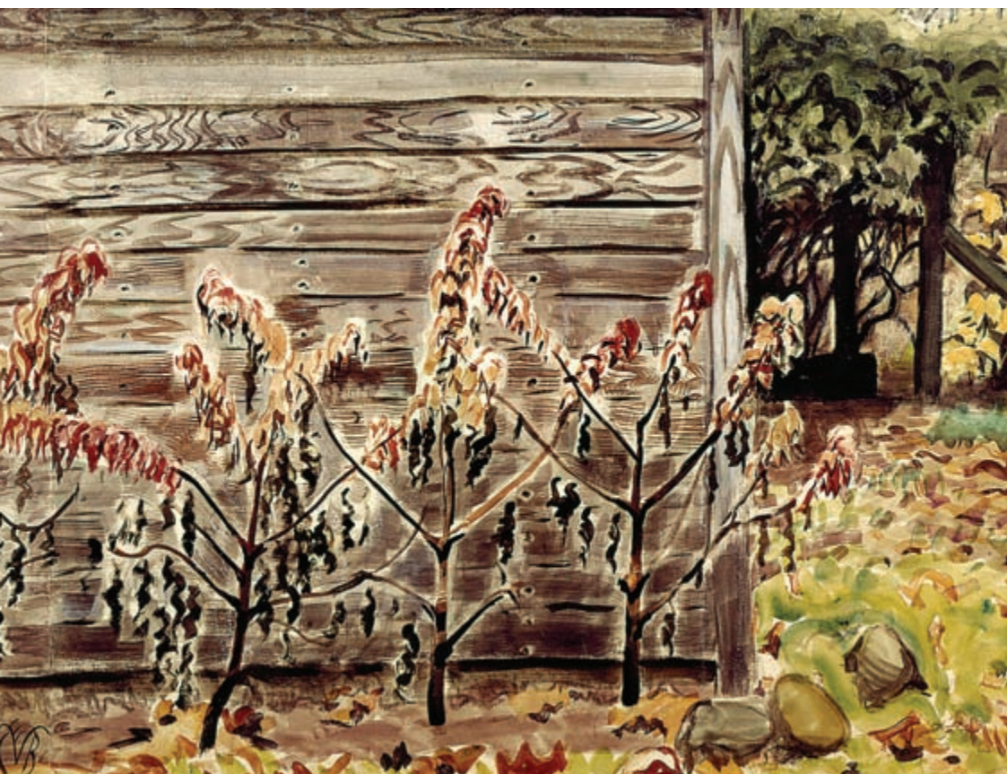
Autumn Embers (Frosted Scarlet Sage) (1944), Charles Burchfield. Watercolor on paper, 22 1/2" x 28".

scientifically beneath the pine where he had learned to walk. Promise hung about us like the leaves, and wherever we looked, ferns unfurled and birds broke into song.